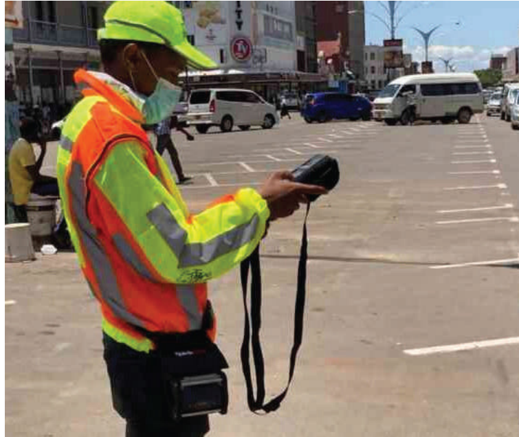
City Parking is a duly registered parking management company, which is wholly owned by the City of Harare

Emergency Road Rehabilitation Programme (ERRP) in 2021 after Mnangagwa declared the state of national roads a national disaster.